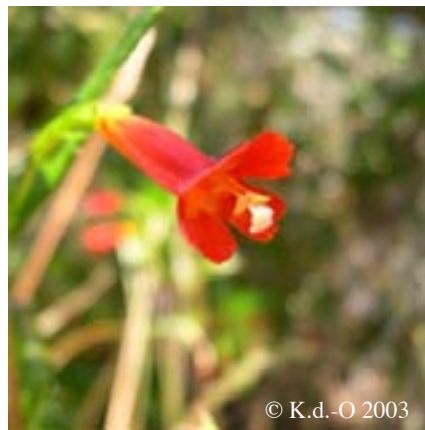
Island Monkey Flower