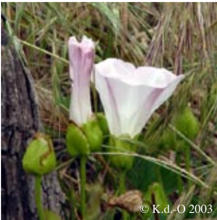
Island Morning Glory