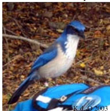
Island Scrub Jay